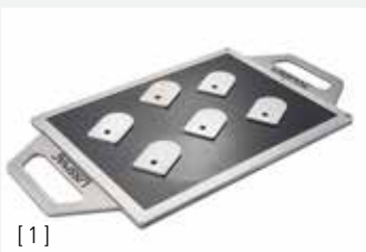
[ 1 ]

[ 1 ] Special molding for processing of small parts